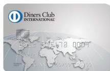
Diners Club International