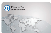
Diners Club International